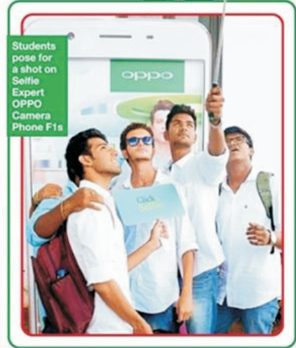
Students pose for a shot on Selfie Expert OPPO Camera Phone F1s