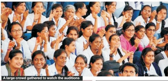
A large crowd gathered to watch the auditions